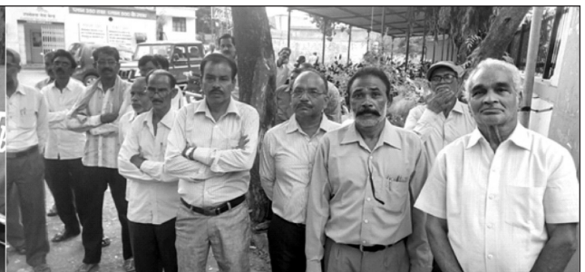
Victory Celebrations at Raipur, Chhattisgarh Circle for achieving 78.2% IDA fixation to Pensioners