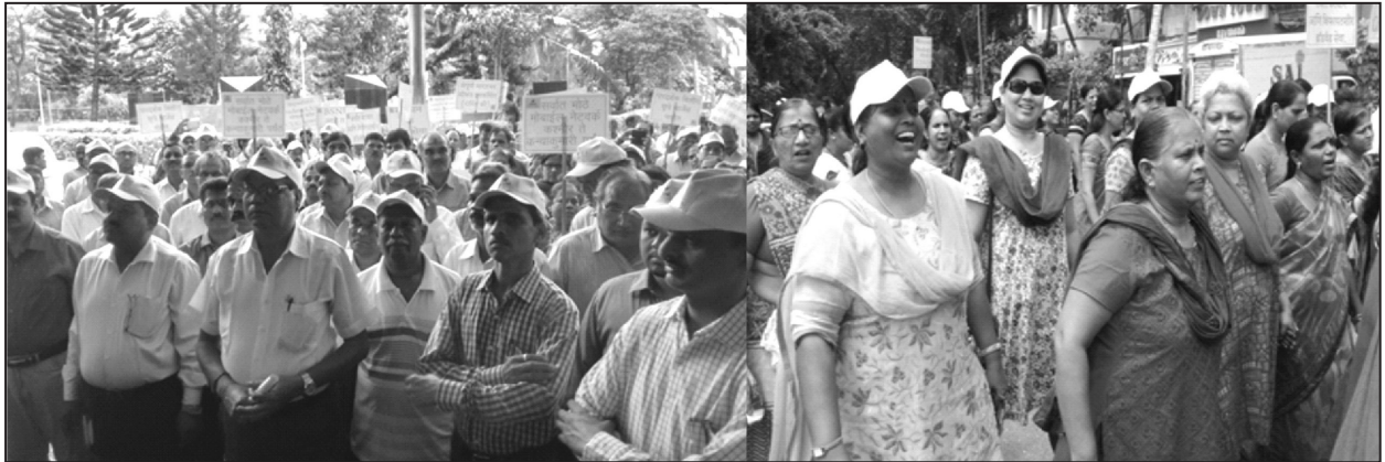
Mumbai CGMT office